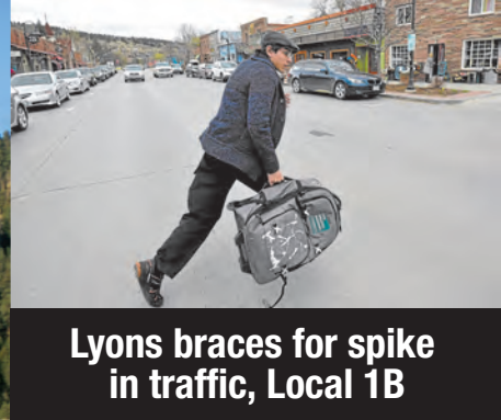
Lyons braces for spike in traffic, Local 1B