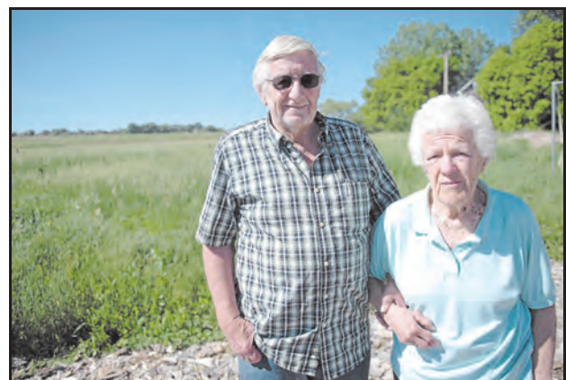
Camera file photo